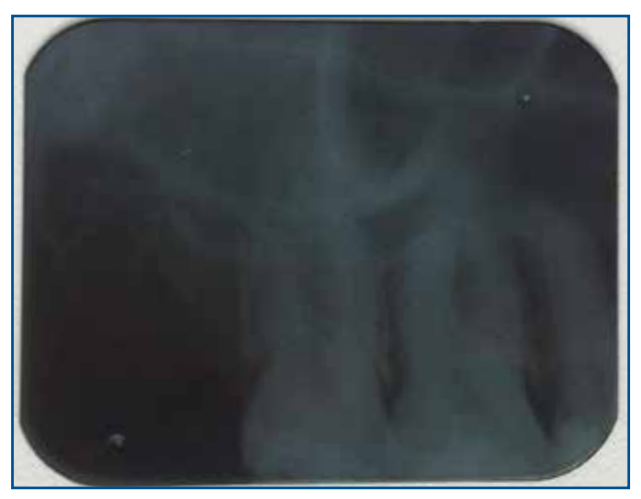
Figure 6: Periapical radiography of the region seven days after the surgery, for purpose of follow up.

Post-surgical follow up was performed 7, 15 and 30 days after tooth extraction. The patient showed a positive evolution, without complications.