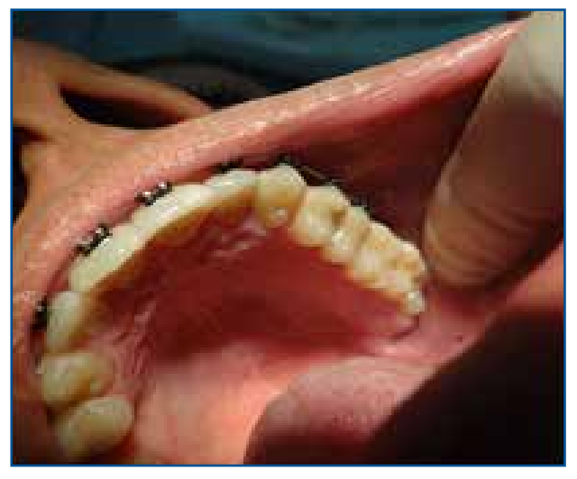
Figure 3: View of the area just before extraction of tooth 28 and the supernumerary upper-left fourth molar.