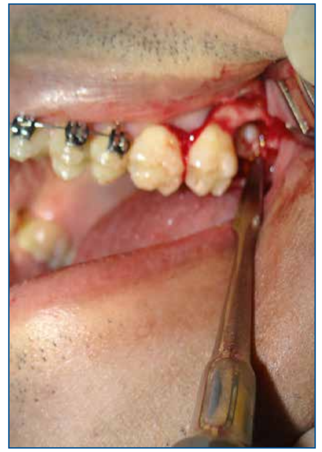
Figure 4: Showing the fourth molar during the excision.

Cefalexin 500 mg, 1 tablet, oral administration, 6/6 h \times 7 days; diclofenac sodium 100 mg, 1 tablet, oral administration 8/8 h \times 3 days; dipyrone, 35 drops, oral administration, 6/6 h, as necessary; chlorhexidine gluconate 0.12%, rinse three times daily \times 7 days<sup>14</sup>.